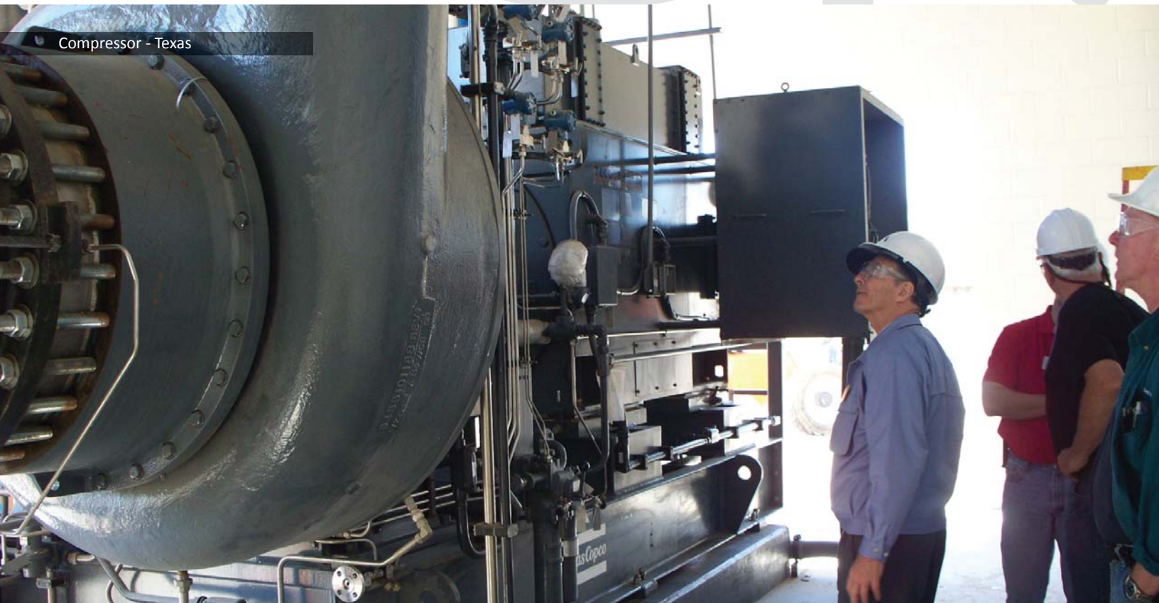
Compressor - Texas