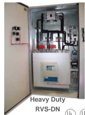
Heavy Duty RVS-DN

Other enclosures and accessories available